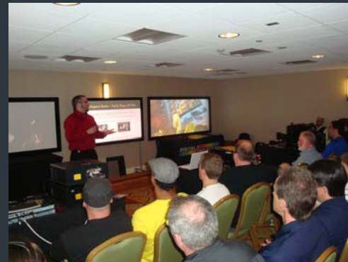
All four video technology classes were filled to capacity with three dozen attendees.