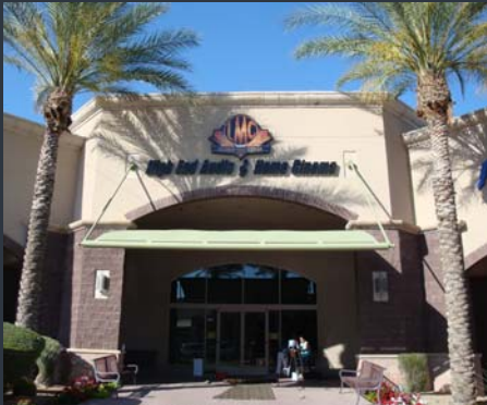
Legendary Music & Cinema's retail store-front located in Scottsdale just off Scottsdale Road & Bell Road