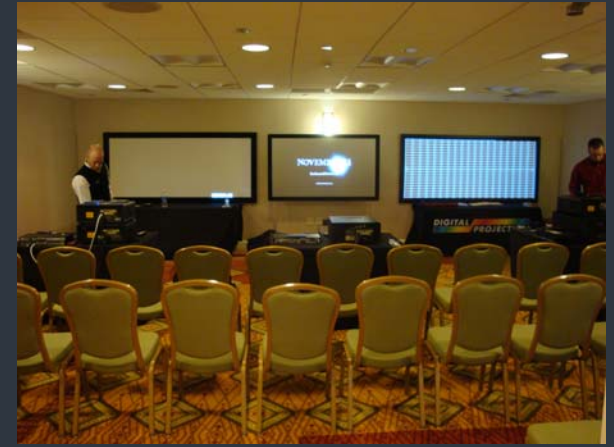
Main video education training room completion awaiting the 36 attendees who signed up for the four training classes sponsored by Digital Projection, DNP Screens and Panamorph Anamorphic lenses.