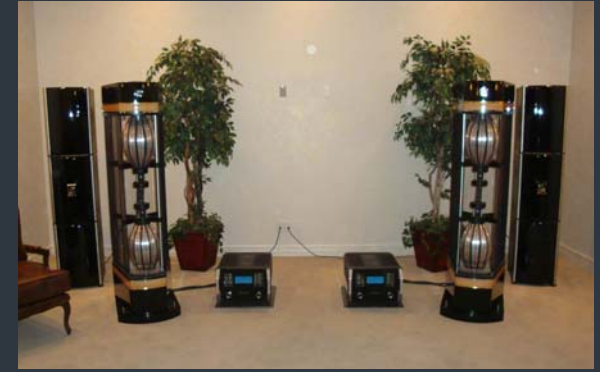
LMC's highest end audio room, with McIntosh gear powering MBL Loudspeakers. Those are McIntosh MC2301 300 watt tube mono-blocks on the floor, at 141 pounds a piece!