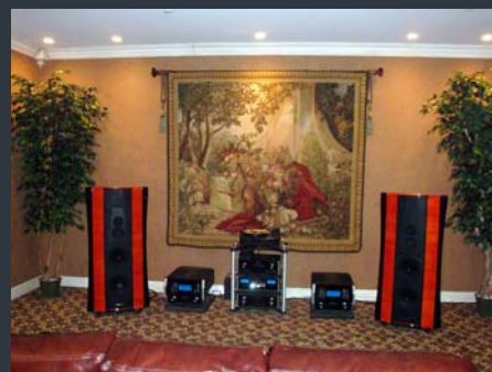
Every demo room at LMC gives customers the opportunity to close the door and enjoy music as long as necessary,.