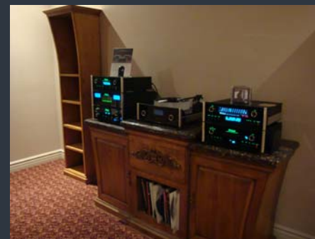
Mike Ware, co-owner of LMC designs their in-store furniture to compliment their rooms. LMC has a full carpentry shop to custom build cabinets for their customers.