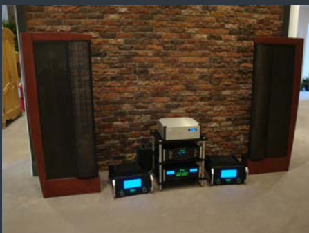
Nearly every corner of the store had McIntosh audio powering loudspeakers from McIntosh, Sonus, Martin Logan and MBL.