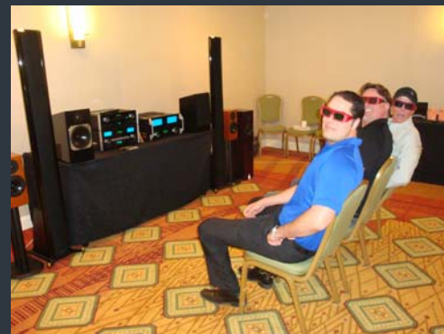
Truly 3-Dimension soundstage from the Totem Element Series and McIntosh Audio products??